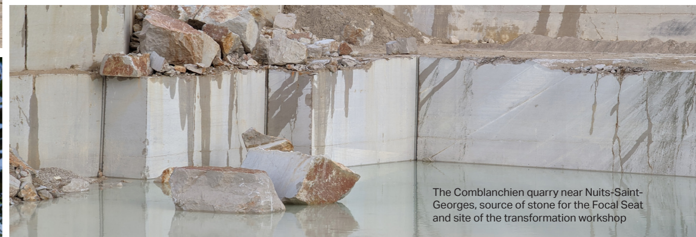
The Comblanchien quarry near Nuits-Saint-Georges, source of stone for the Focal Seat and site of the transformation workshop